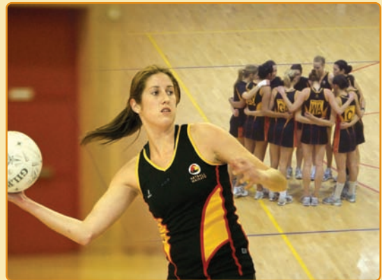
The Trust Waikato Netball Team prepares to take to the court.

And judging by the figures, there's plenty of talent waiting to rise to the challenge. Netball in our region is extremely popular with over 15,000 players and umpires registered along with 1,150 coaches; some of the highest rates in New Zealand.