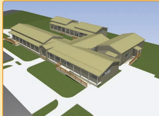
Architect visual of the new Whitianga Community Services Centre facility

Trust Waikato knows how vital The Whitianga Community Services Trust is to their wider community. We have donated $116,000 toward the new facility.